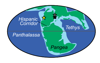
Figure 1. Global paleogeography during Toarcian and location of Ya Ha Tinda (Alberta, Canada; yellow star), Strawberry Bank (UK; gray star), and Posidonia Shale (Germany; black star) Lagerstätten. Green areas are landmasses, light-blue areas are shallow seas, and dark blue represents open oceans.

Here we describe a new Early Jurassic (Pliensbachian–Toarcian) Lagerstätte from Alberta, Canada: the Ya Ha Tinda assemblage (Fig. 1). This deposit is significant as both the first marine Konservat-Lagerstätte described from the Jurassic of North America and the first described Pliensbachian–Toarcian Lagerstätte outside of Europe.